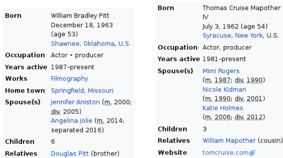
Fig. 2. Wikipedia infoboxes for actors Brad Pitt (left) and Tom Cruise (right).

tioned similarities that could be obtained by manual inspection of the infoboxes. In particular, we found that both Brad Pitt and Tom Cruise are: